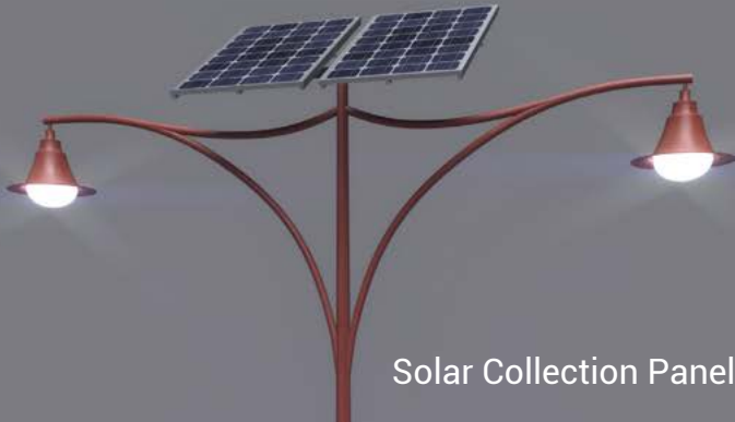
Solar Collection Panel