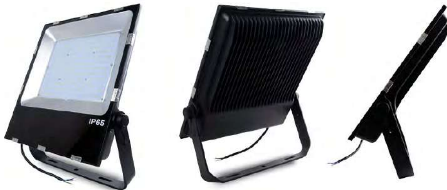
High Performance, Slim Line LED Flood Light