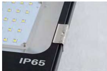
Ingress Protection: IP65