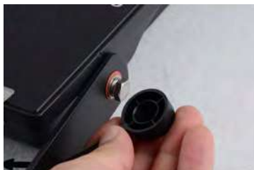
Mounting Bolt Cover