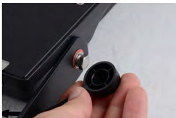
Mounting Bolt Cover