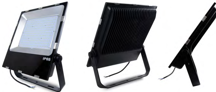
High Performance, Slim Line LED Flood Light