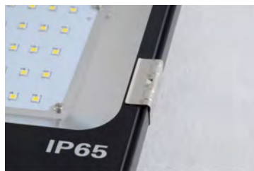
Ingress Protection: IP65